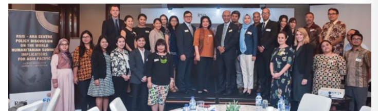
Group photo of the policy discussion

During the first session, panellists were discussing on the process that have been achieved since the WHS, the remaining gaps and challenges, the extent of WHS outcome documents and the ASEAN Vision 2024 on disaster management are mutually reinforcing, the overlaps between it, and aspects that are still missing during the progress.