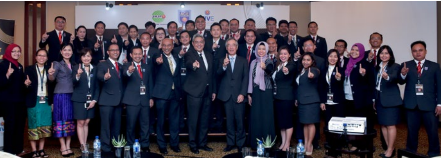
Group photo of the conference

The first ACE Programme was conducted in 2014 and heretofore the programme has formed 45 graduates as of 2016 who are the future leaders of disaster management. This year marks the first ACE Programme Annual Conference that brought together all graduates of the ACE Programme to engage in discussion and group activities to provide policy inputs, recommendations and alternative solutions to the ongoing and potential challenges of ASEAN regional mechanism on disaster management.