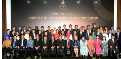
Group Photo during the Five to Life Journey of Partnership and Progress Commemoration

– Milestones of the Development of the AHA Centre