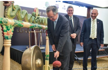
Official opening ceremony of the first ACE Programme Conference