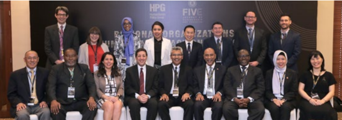
Group photo of the conference