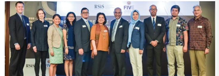
Group photo of all panelists of the discussion

The policy discussion aimed to discuss the outcomes of the WHS, what has been achieved, the remaining gaps and challenges, and to what extent the WHS outcome document and the ASEAN Vision 2025 on disaster management are mutually reinforcing. The discussion was held as part of the series of events commemorating the fifth anniversary of the AHA Centre.