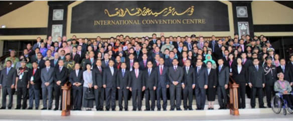
Group photo with ARDEX Participants

A conclusion regarding the action plan for the upcoming year of the ROHAN was drawn on the 17 November 2016. The ROHAN Conference was held as part of the series of events in commemorating the fifth anniversary of the AHA Centre.