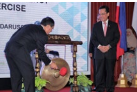
Opening of ARDEX 2016 by Secretary-General of ASEAN

The National Disaster Management Centre of Brunei Darussalam and the AHA Centre conducted the ASEAN Regional Disaster Emergency Response Simulation Exercise 2016 (ARDEX-16) in Bandar Seri Begawan, Brunei Darussalam from 29 November – 2 December 2016.