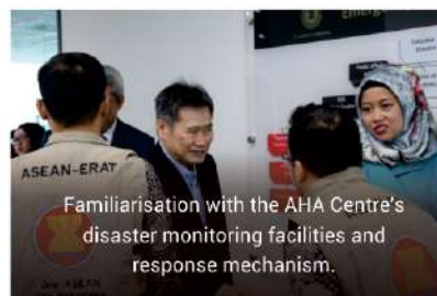
Familiarisation with the AHA Centre's disaster monitoring facilities and response mechanism.