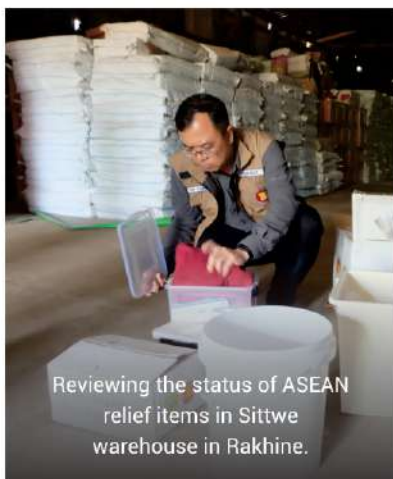
Reviewing the status of ASEAN relief items in Sittwe warehouse in Rakhine.