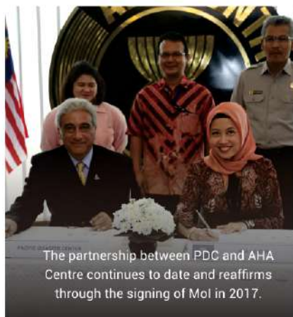
The partnership between PDC and AHA Centre continues to date and reaffirms through the signing of MOI in 2017.

ASEAN's collaboration with the PDC began in mid-2004, prior to the Indian Ocean Tsunami, and the PDC has been constantly involved in the implementation of the ASEAN Agreement on Disaster Management and Emergency Response (AADMER). More recently, the PDC – supported by the United States Government through its US Agency for International Development (USAID) programmes – has worked with ASEAN and the AHA Centre to implement programmes such as the AADMER Work Programme for Risk Assessment, Early Warning, and Monitoring Activity