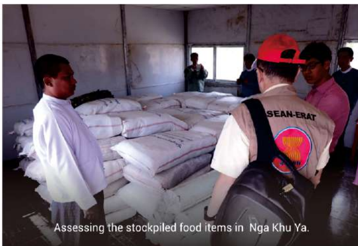
Assessing the stockpiled food items in Nga Khu Ya.