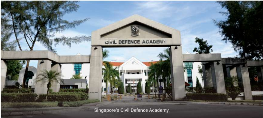
Singapore's Civil Defence Academy.

Due to its geographical location which is outside the 'Pacific Rim of Fire', Singapore is spared from natural disasters such as tsunamis, earthquakes, and volcanic eruptions. However, Singapore cannot insulate itself from disaster prevention and management efforts as it is still susceptible to man-made disasters; which can be in the form of terror attacks or hazmat incidents. The Singapore Civil Defence Force (SCDF), under the command of Ministry of Home Affairs, is the National Authority that will coordinate, plan, command and control all operations undertaken by the various agencies to mitigate major disasters.