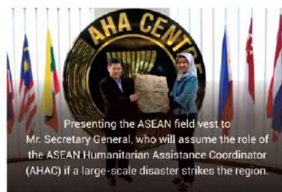
Presenting the ASEAN field vest to Mr. Secretary General, who will assume the role of the ASEAN Humanitarian Assistance Coordinator (AHAC) if a large-scale disaster strikes the region.