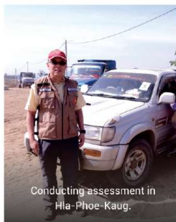
Conducting assessment in Hla-Phoe-Kaug.

The ASEAN-ERAT team also observed the state of temporary shelters, prepared by the Government of Myanmar for displaced communities in Rakhine, as well as those that may return from outside the State. This temporary settlement is equipped with clean water, as well as pre-positioned materials such as clothes, food, and kitchen sets.