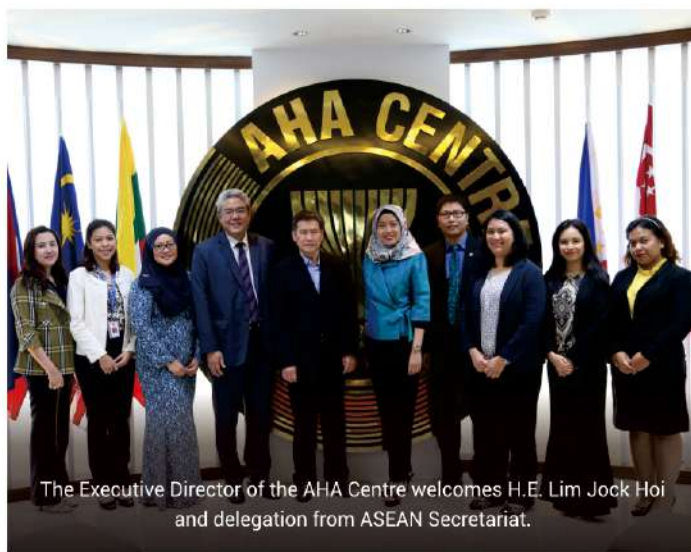
The Executive Director of the AHA Centre welcomes H.E. Lim Jock Hoi and delegation from ASEAN Secretariat.