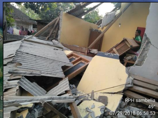
RPH sambella 49° 07/29/2018 06:58:53