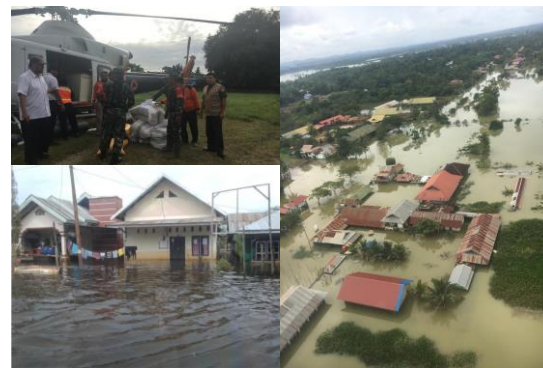
Flooding in Konawe Regency, Southeast Sulawesi.