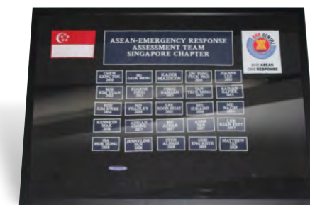
Singapore ASEAN-ERAT Chapter members pinning their unique identification tag onto the ASEAN-ERAT Singapore Chapter Board