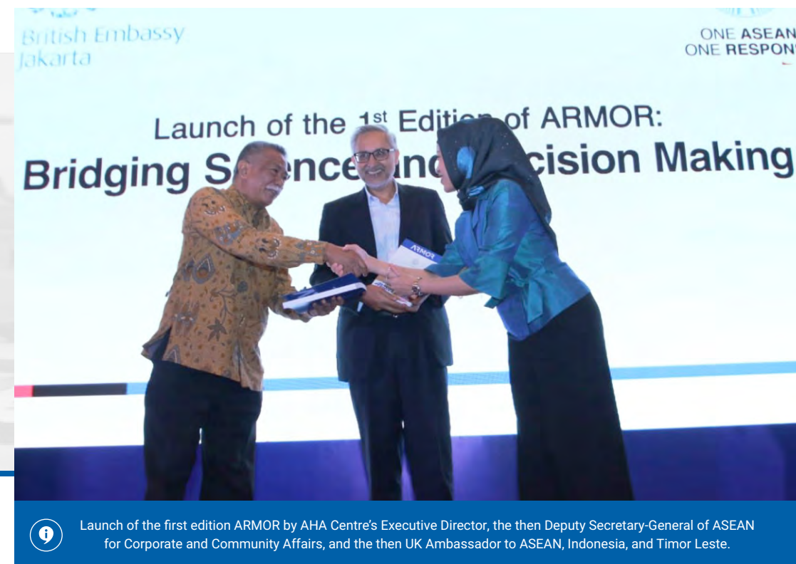
Launch of the first edition ARMOR by AHA Centre's Executive Director, the then Deputy Secretary-General of ASEAN for Corporate and Community Affairs, and the then UK Ambassador to ASEAN, Indonesia, and Timor Leste.

In 2017, the UK government – through the British Embassy in Jakarta – supported the AHA Centre initiative for Public-Private Partnerships dialogue. The AHA Centre's aim to engage further with new stakeholders, especially from the private sector and the media, came about due to the increasing importance of Public-Private Partnerships (PPP) in disaster management. It was becoming increasingly apparent that the immense resources required to manage disasters in the region could not be achieved by the AHA Centre alone, and therefore the need for active, coordinated and strategic participation from other stakeholders became a priority. The event featured an interactive high-level panel dialogue with prominent speakers. Momentum from the event was used to gain insights and discussion with potential partners, to then build innovative partnerships for developing a more resilient ASEAN community. The role of the AHA Centre as the primary regional coordinating agency in disaster management in the ASEAN region is also to promote good PPP practices across the region for managing disaster preparedness, response and recovery efforts.