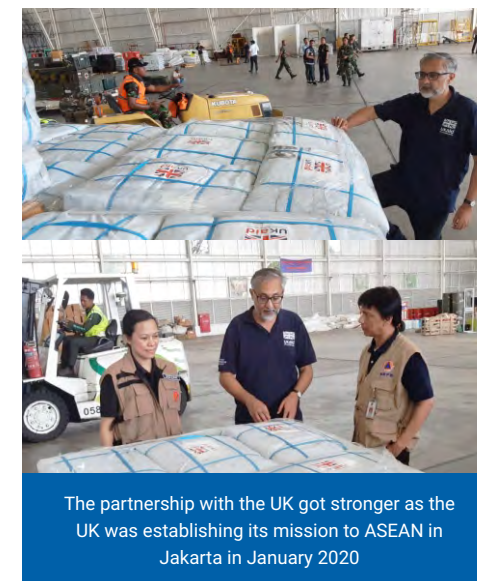
The partnership with the UK got stronger as the UK was establishing its mission to ASEAN in Jakarta in January 2020

Continuing this innovative partnership, early in 2019 the AHA Centre launched the first edition of the ASEAN Risk Monitor and Disaster Management Review (ARMOR). The report – which contains a collection of ten chapters by disaster management experts and practitioners – provides new analysis and insights on the science behind disaster management, and its applicability to policy making. A key aim of ARMOR is to bridge the gap between science and decision-making in disaster management, with the launch event opening discussions between scientists and decision-makers. The report addresses the various aspects of disaster management in Southeast Asia today, ranging from climate change, disaster monitoring systems, early warning systems, technological accidents triggered by natural hazards (NATECH), and strategy, policy, and practice in disaster management. The production of this publication was supported by the Government of the United Kingdom, again through the British Embassy in Jakarta.